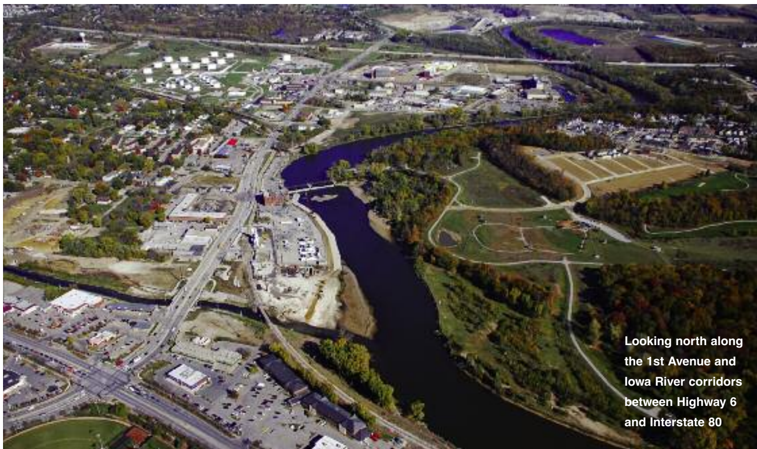
Looking north along the 1st Avenue and Iowa River corridors between Highway 6 and Interstate 80